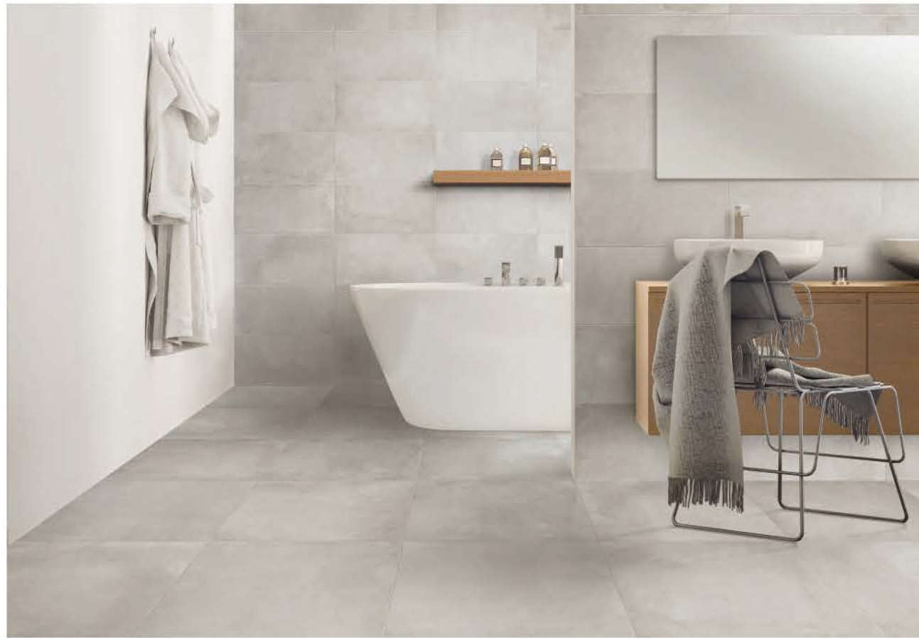
floor BETON LIME 60x60 - 24"x24"