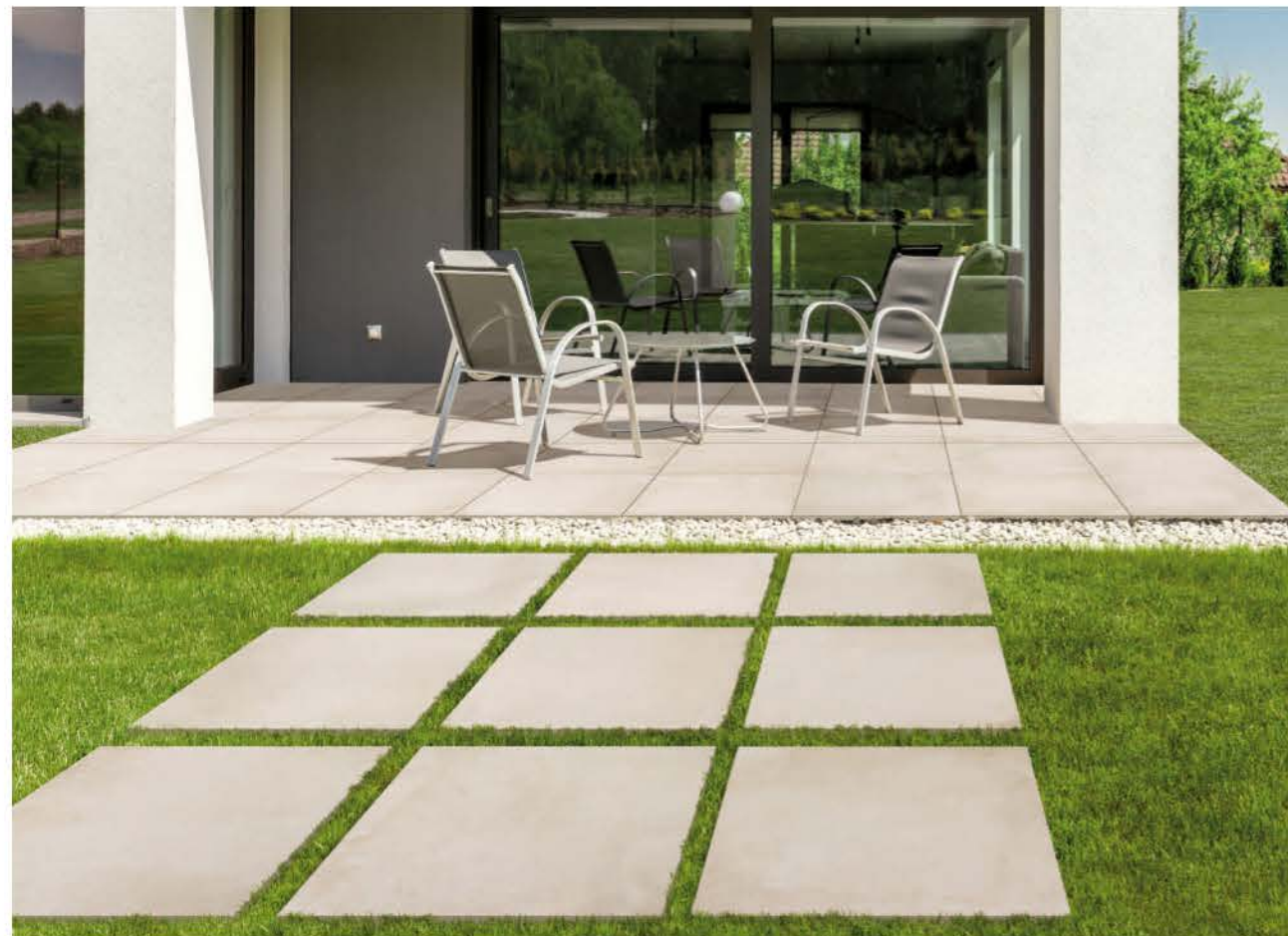
floor BETON GRIT 60x60 - 24"x24" R11 20mm