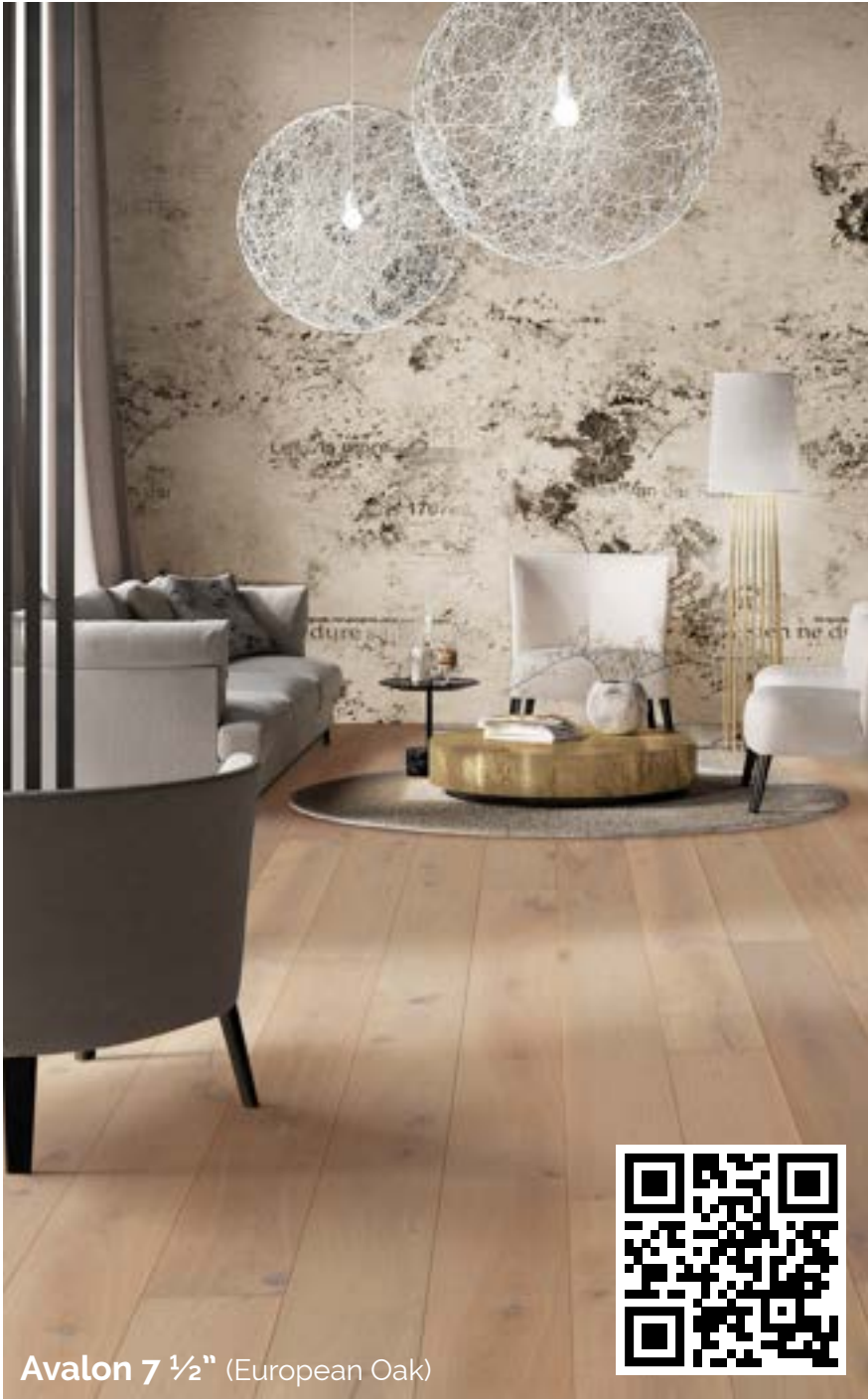
Avalon 7 1/2" (European Oak)