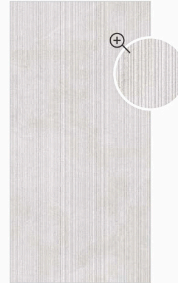
HORIZON DACITE SILVER TEXTURE