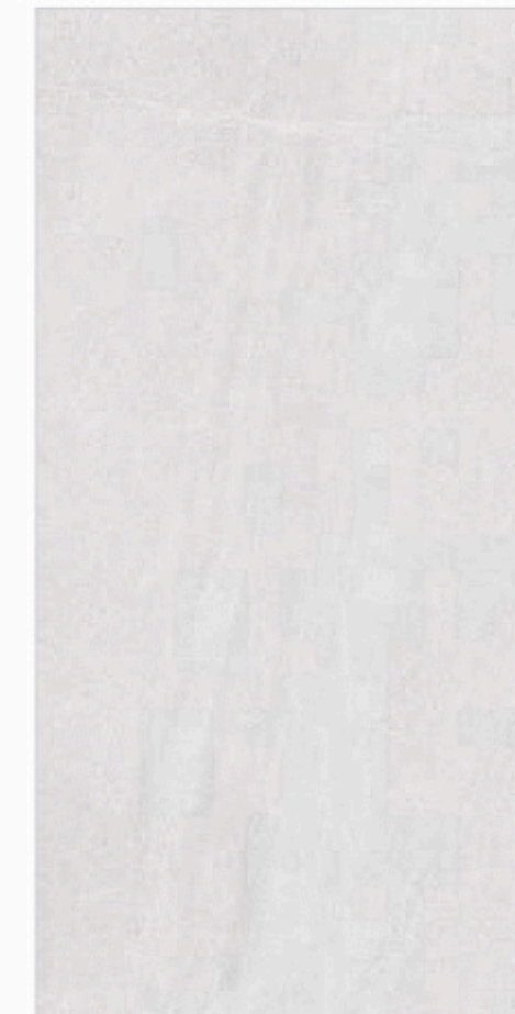
DACITE SILVER STRONGX (MATT) DACITE SILVER PGVT (GLOSSY)