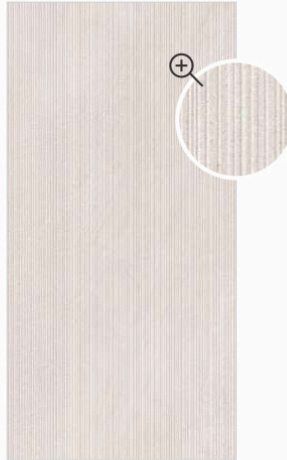
HORIZON DACITE CREAM TEXTURE