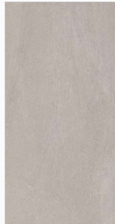
DACITE ASH STRONGX (MATT) DACITE ASH PGVT (GLOSSY)