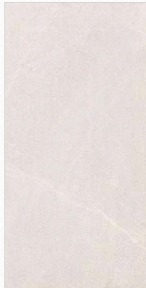
DACITE CREAM STRONGX (MATT) DACITE CREAM PGVT (GLOSSY)