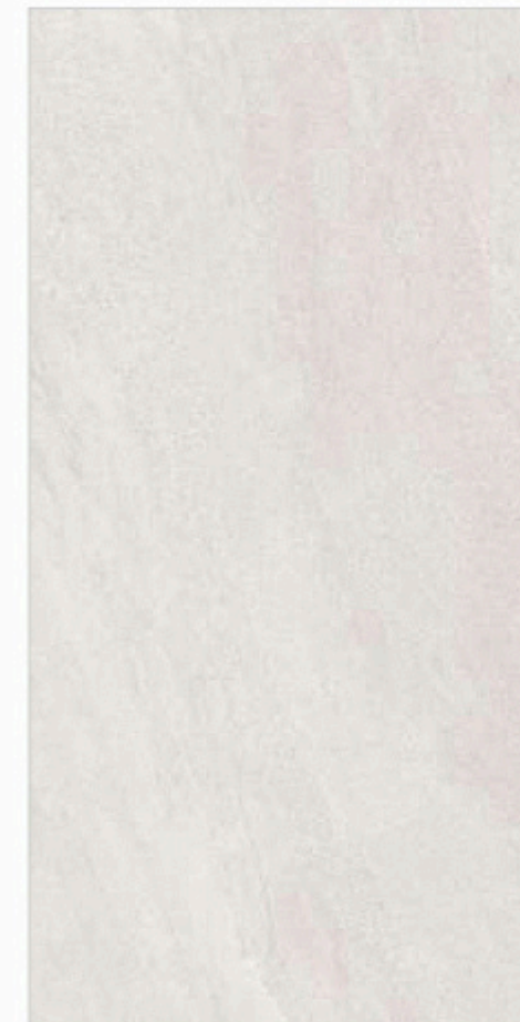
DACITE PEARL STRONGX (MATT) DACITE PEARL PGVT (GLOSSY)